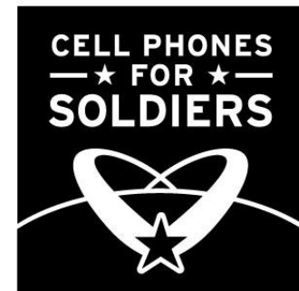
Black and White